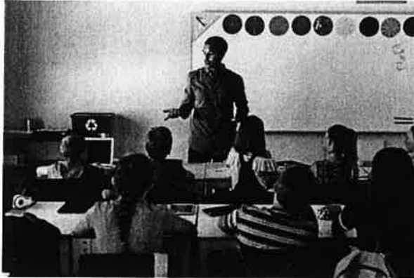
Figure 2. Classroom without adequate spacing between students

partitions between students or desks, or arranging desks in a way that minimizes face-to-face contact.