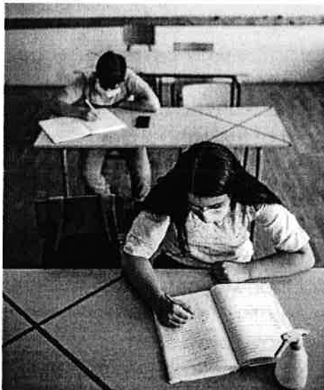
Figure 1. Classroom with adequate spacing between students

Distance student chairs at least 6 feet away from one another, except where 6 feet of distance is not possible after a good-faith effort has been made. Upon request by the local health department and/or State Safe Schools Team, the superintendent should be prepared to demonstrate that good-faith effort, including an effort to consider all outdoor/indoor space options and hybrid learning models. Please reference Figures 1 and 2 for examples of adequate and inadequate spacing. Under no circumstances should distance between student chairs be less than 4 feet. If 6 feet of distance is not possible, it is recommended to optimize ventilation and consider using other separation techniques such as